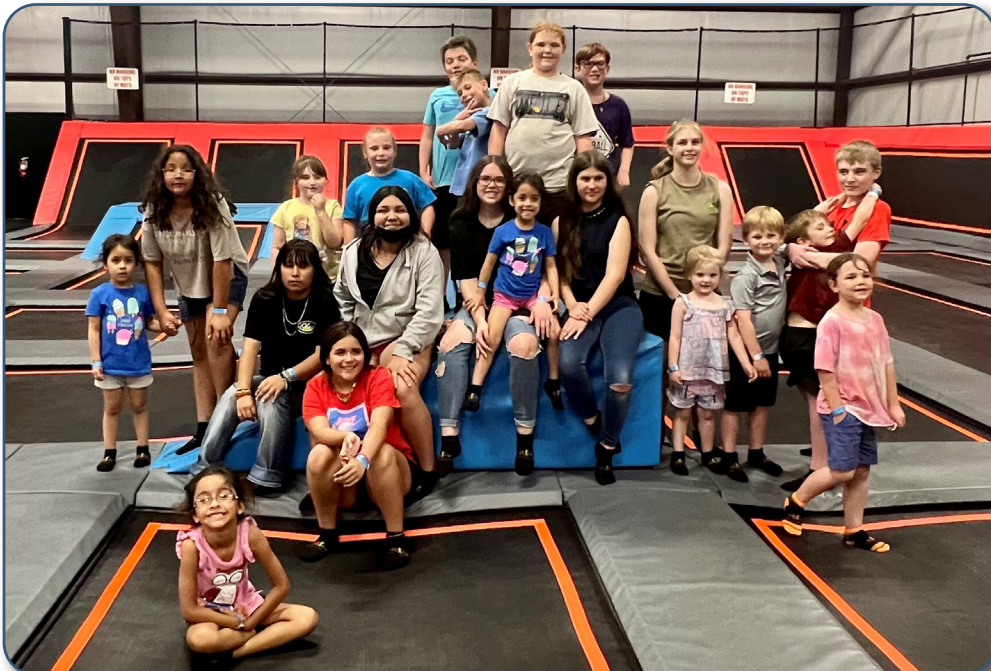
Children and youth had a fun time for their "end of year" party at Ultimate Air on Wednesday, May 18.