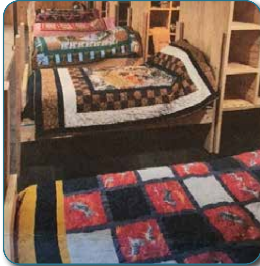
Bunkhouse with quilts made by Threads of Blessing