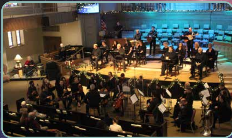
The Christmas Orchestra and singers presented Behold the Lamb of God .