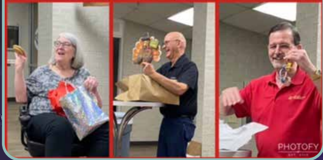
The Responders (Adult 4) always have a lot of fun at their White Elephant exchange!