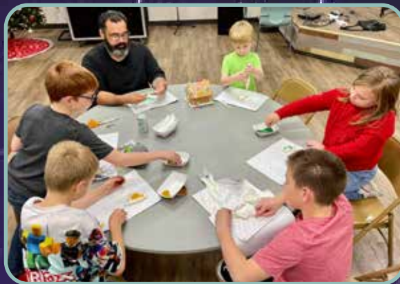
FBC Kids had a wonderful time at our Christmas Party! We decorated gingerbread houses as a team, iced cookies and made ornaments.