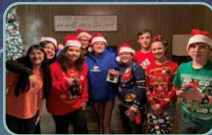
The youth had a blast at their party with good food, Christmas "headbands" game and a gift exchange.