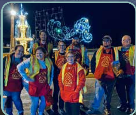
It was wonderful weather to host the Tour of Lights together! Thank you to these two teams who served as Community Hosts.