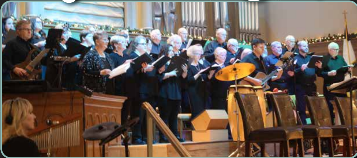
The Christmas Choir opened the service on December 19 with favorite Christmas anthems from past years.