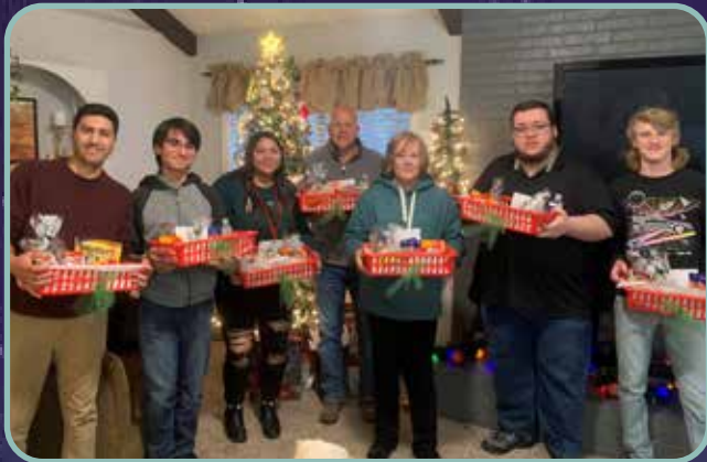
The Crossovers group made goodie baskets and took them to some of our older members who aren't able to get out.