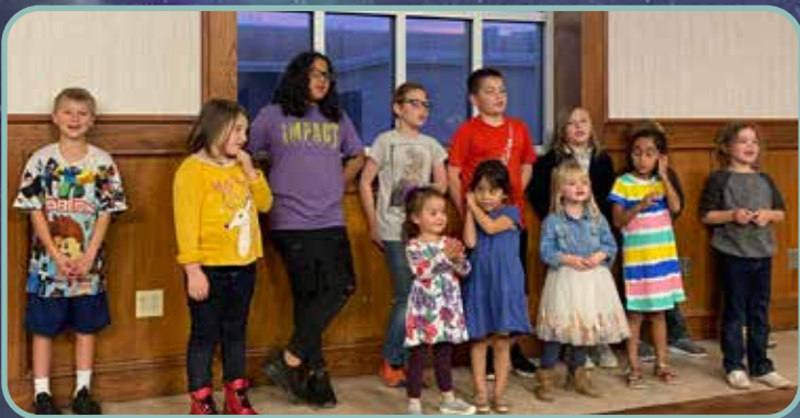
The children sang "Wasn't that a Mighty Day" for those at the Wednesday Night Bible Study.